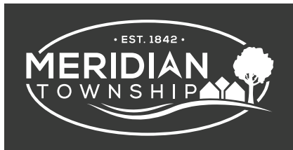
Reversed to white on dark background