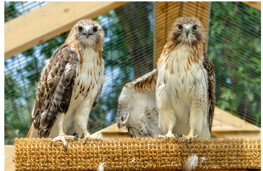
Aztec & Talon