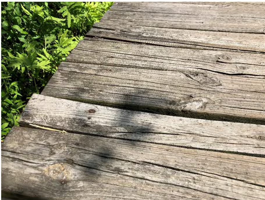
Above right and immediate left: Typical condition of boardwalk planks – deteriorated and heaved, with gaps that are a trip and fall/safety concern.