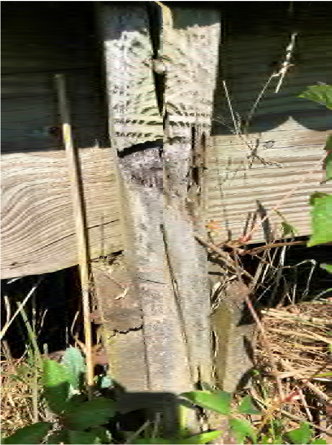
Many of the boardwalk support posts and beams are split and broken, causing the boardwalk to sink.