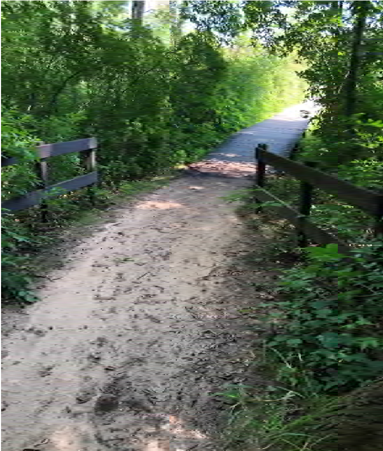
Left: Existing dirt path trail is not ADA accessible.