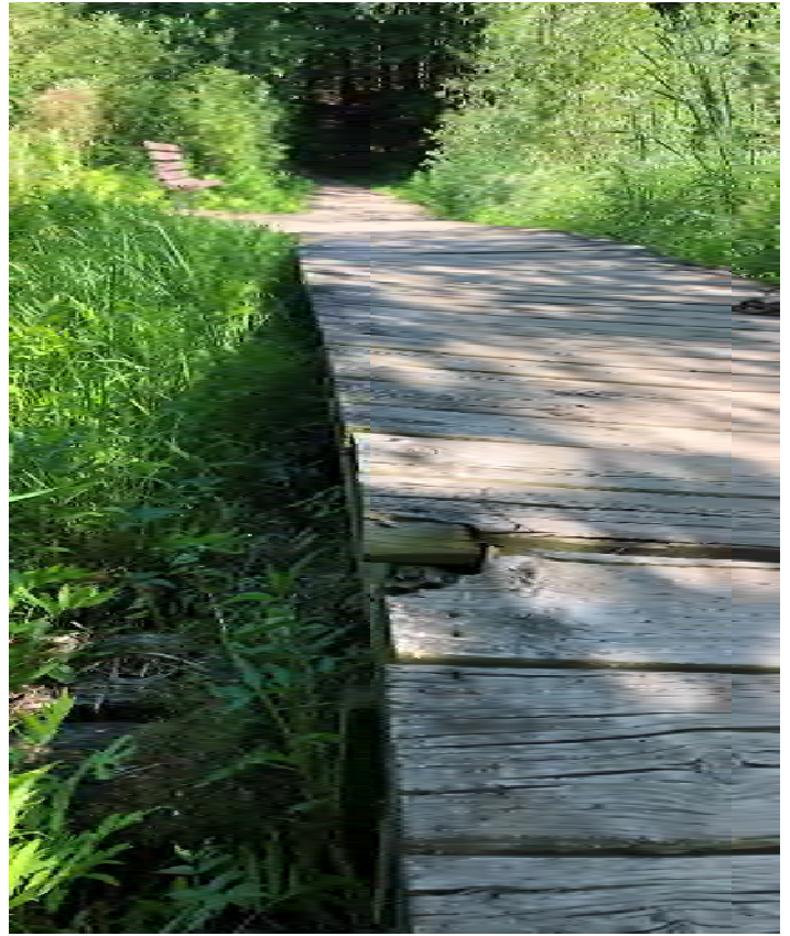
Above Left: Missing and heaved boardwalk planks are a safety hazard. Above Right: Deteriorated boardwalk planks. There are no existing curbs or bumpers on the boardwalk, causing a potential roll-off hazard for wheelchair users. Below: Deteriorated entrance sign.