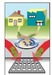
resulting in increased cost to residents due to repair and maintenance costs.