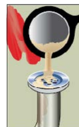
By putting fats, oils and grease down the drain...