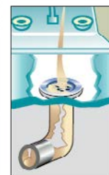
FOG builds up inside pipes and can cause a complete blockage.