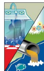
Clogged pipes overflow in your home and in the environment,