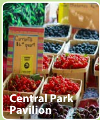
Central Park Pavilion

MAY 6 - JUNE 24 Saturdays only: 8 am - 2 pm JULY 1 - OCTOBER 28 Wednesdays: 8 am - 2 pm Saturdays: 8 am - 2 pm