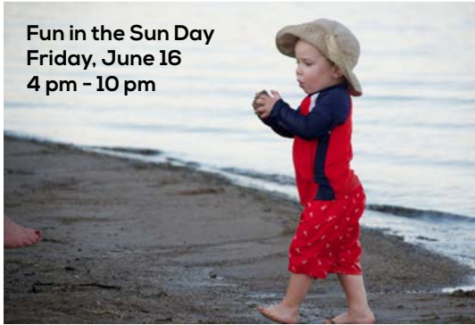
Fun in the Sun Day Friday, June 16 4 pm - 10 pm